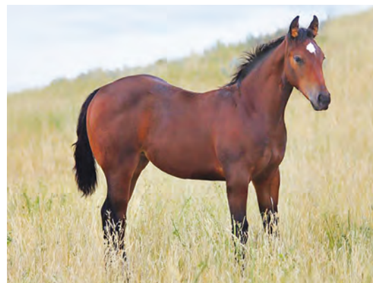
2017 | Current progeny