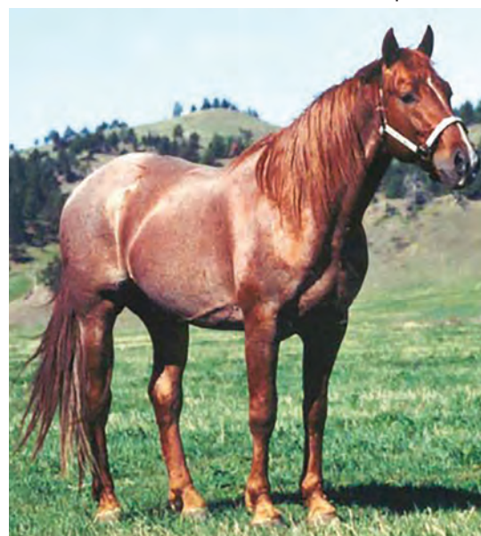
2000 | Ima Bit of Heaven