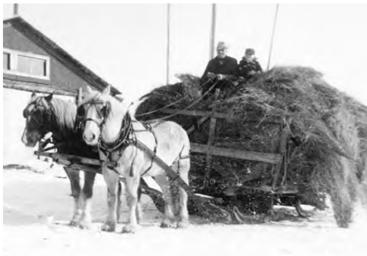
1962 | Art and Stan